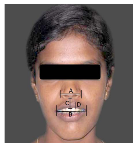
[Table/Fig-3]: Cephalometric landmarks [Table/Fig-4]: Four linear and three angular measurements in lateral aspect [Table/Fig-5]: Postoperative frontal photograph

of the compensation that is occurred due to skeletal deformity, align upper and lower teeth and co-ordinate upper and lower arch. In postoperative orthodontic treatment residual space distal to canine is closed, minor leveling and alignment is done to correct the occlusion. Preoperative and postoperative records consisted of lateral cephalogram and frontal and lateral photographs. Lateral cephalograms were analysed using Cephalometrics for orthognathic surgery (COGS).COGS system describes horizontal and vertical portion of the facial bones by use of constant versatile system. Preoperative cephalometric measurements were taken before starting orthodontic treatment. Postoperative measurements were taken six months after surgery. Preoperative and postoperative measurements were carried out by the author. Reference plane constructed were FH – plane [H line] and nasion vertical plane (V line), which were perpendicular to FH – plane. Following landmarks were used [Table/Fig-3].