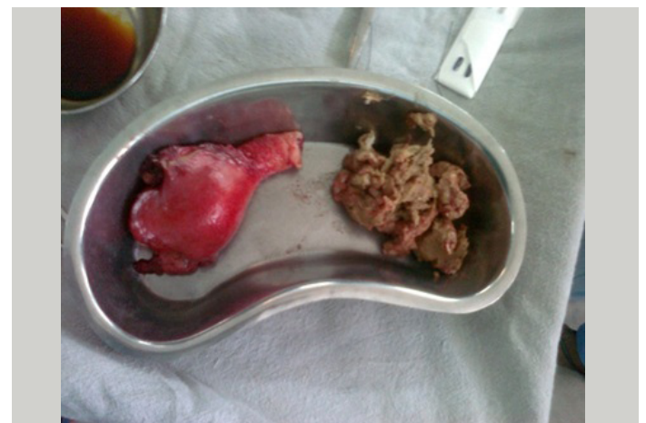
[Table/Fig-1]: Uterus with cervix on the right and the cheesy material from the cyst on the left

Epidermoid cysts are benign slow growing lesions which arise due to implantation of epidermis into the dermal layer of skin. They are more