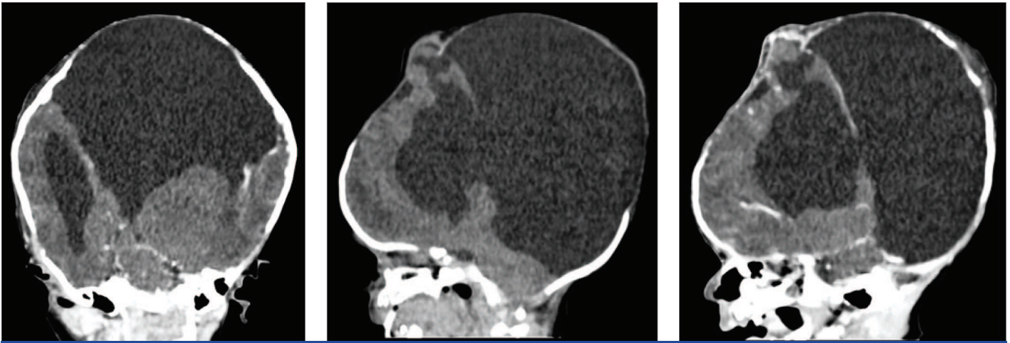
[Table/Fig-4]: Coronal post contrast ct head shows a large well defined non enhancing, hypo dense intracranial cystic lesion with attenuation value similar to CSF in bilateral posterior parietal and occipital regions. The lesion communicated with bilateral lateral ventricles and subarachnoid space. Bilateral lateral ventricles appeared dilated with thinning of over lying brain parenchyma. Bilateral thalami appeared normal [Table/Fig-5]: Sagittal Plain CT head shows a large cystic lesion in parietal and occipital regions with communication in lateral ventricle and subarachnoid space. Brain stem is displaced anteriorly and cerebellum is compressed from superiorly. Widely open anterior and posterior fontanelle with small amount of brain parenchyma tissue seems to herniate from anterior fontanelle [Table/Fig-6]: Sagittal post contrast CT head shows a large non enhancing hypo dense intracranial cystic lesion in posterior parietal and occipital region with communication in lateral ventricle and subarachnoid space. Widely open anterior and posterior fontanelle with small amount of brain parenchymal tissue seems to herniated from anterior fontanelle

it is internal and communicating with the subarachnoid space then external type. It is lined by white matter. Gliosis will develop if the insult is as early as 20 wk of gestations [2].