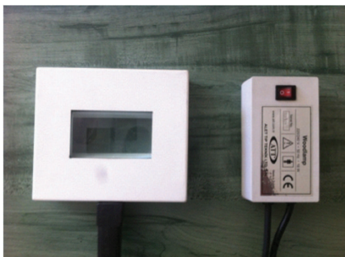
[Table/Fig-1]: Wood's Light