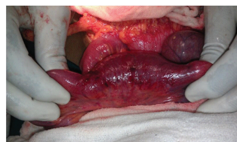
[Table/Fig-3]: Bowel viable after reduction