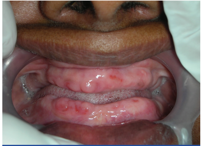
[Table/Fig-5]: Two months postoperation