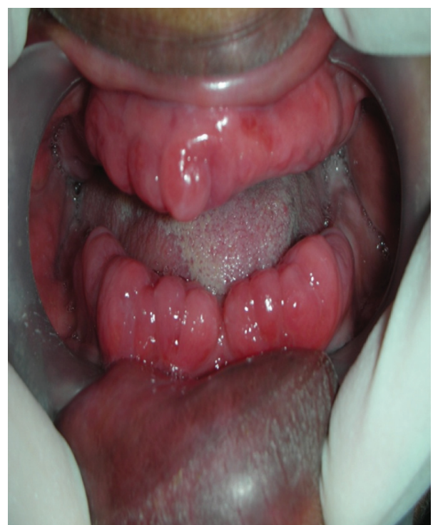
[Table/Fig-1]: First visit of patient with DIGO

On examination after two months [Table/Fig-5], the overgrowth had subsided almost completely except for minor fibrous nodules remaining in mandibular and maxillary right anterior edentulous region. Hence patient was referred to Department of Prosthodontics for complete denture rehabilitation.