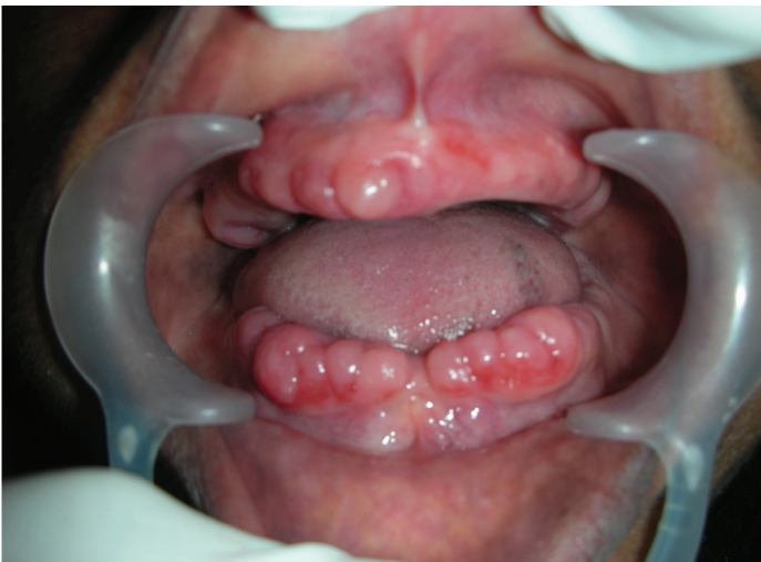
[Table/Fig-3]: Two weeks after initial visit showing fibrotic overgrowth