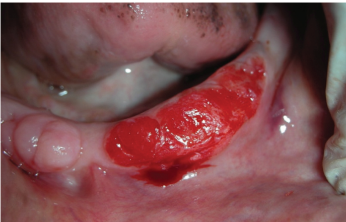
[Table/Fig-4]: Surgical excision of overgrown tissue