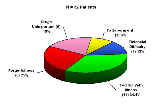
(Table/Fig 2) Reason for Non-Compliance of ASMs