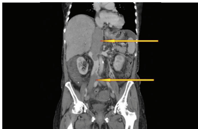
[Table/Fig-1]: CECT abdomen; coronal section at the level of IVC, showing thrombus involving the proximal and intrahepatic IVC along with left, right and middle hepatic veins. There was complete thrombotic occlusion of left proximal renal vein and bilateral common iliac, external iliac, proximal internal iliac, common femoral veins

A 2D echocardiogram showed a cruciate shaped thrombus in the IVC and there was no pulmonary artery hypertension. There was no normal IVC segment for filter deployment [2]. She was anti-coagulated with sub-cutaneous enoxaparin sodium and later changed over to oral warfarin [3]. She showed good clinical improvement on follow up, her pedal oedema has decreased and abdominal veins were less prominent. Follow up Ultrasound showed no further increase in size of thrombus.