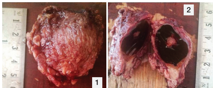
[Table/Fig-1]: A grey brown colour, irregular, intact soft tissue [Table/Fig-2]: Cut section showing a single cystic cavity having smooth surface filled with gelatinous material

Although the diagnosis of PA is usually made with ease on cytology, cystic PAs pose certain diagnostic challenges. PA, representing a large number of salivary gland neoplasms, is usually easily recognized when evaluated by FNAC, however metaplastic changes, degeneration and altered differentiation can pose a diagnostic challenge [1]. This has been emphasized by authors that there is need for a cautious and systematic approach in the cytologic and histopathologic interpretation of cystic pleomorphic adenoma with metaplastic epithelial changes [7]. Considerable variation in the proportions of the constituent elements is a challenge resulting in differential which include low-grade carcinomas, monomorphic adenoma, metastases, and the plasmacytoid appearance of the myoepithelial cells may be mistaken for malignant lymphoma or plasma cell proliferations [6]. However, as seen in the present