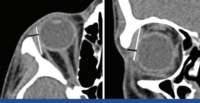
[Table/Fig-1]: White line represents the axial length and black line represents the axial width in the axial CT image. [Table/Fig-2]: White line represents the coronal length and black line represents the coronal width in the coronal CT image