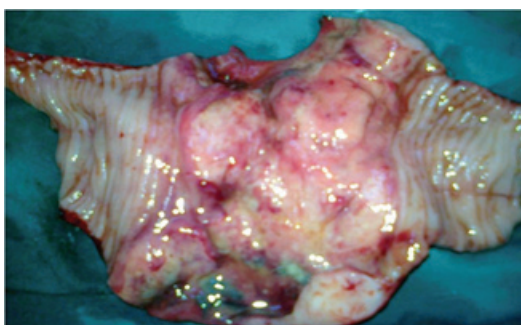
[Table/Fig-1]: Erect Chest X-ray showing thin rim of air under right Diaphragm. [Table/Fig-2]: On table photograph, showing the jejunal mass with perforation. [Table/Fig-3]: Gross specimen after lay opening showing ulceroproliferative lesion.