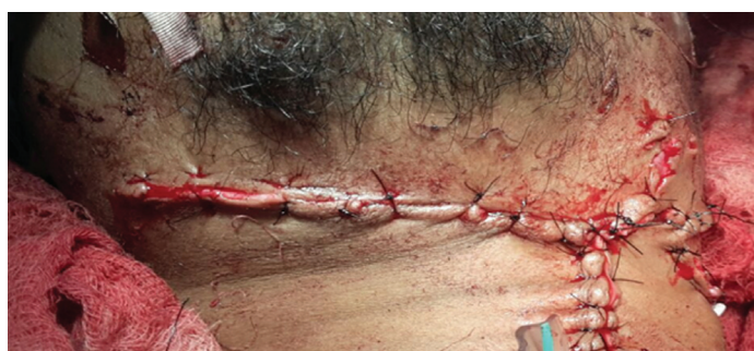
[Table/Fig-2]: Showing completed repair after skin closure.