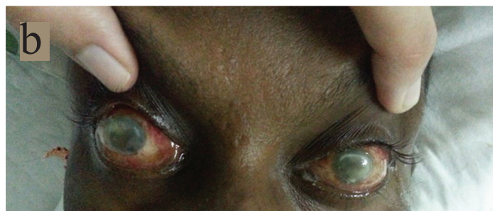
[Table/Fig-1]: (a) Bilateral dry gangrene of lower limbs; (b) Bilateral redness in both eyes; Diagnosed with endophthalmitis